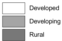
Map 6: Prince George's County Development Tiers