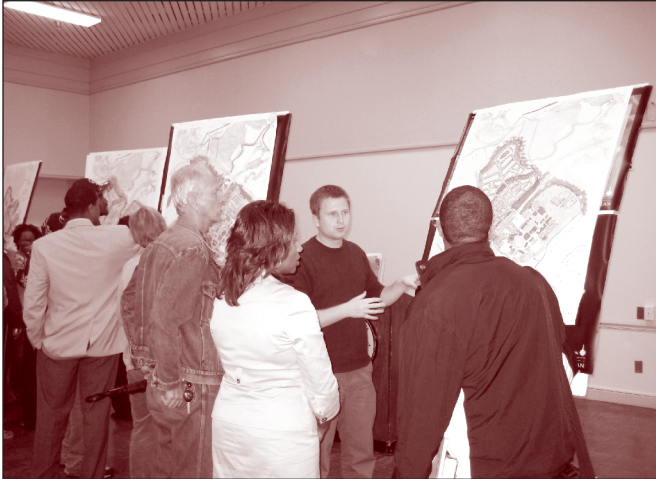
A community charrette solicited stakeholders' suggestions and visions for the community center.

The charrette itself represented the main segment of the charrette process and was conducted from September 30, 2008, through October 3, 2008, at Bowie State University. The charrette was an intense and collaborative planning process during which stakeholders and the M-NCPPC team developed a preferred design concept for the project area. The charrette started with a student question-and-answer session and a kick-off presentation on September 30, followed by an open house on October 1 and final presentation on October 3. Residents, business owners, and BSU students, faculty, and staff provided input and feedback throughout the week as the design team worked to develop the concept plan.