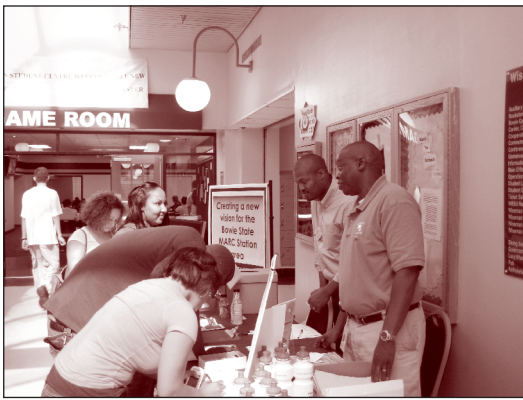
Bowie State University information booth.

A charrette is a three-pronged, multi-day planning and design process composed of a pre-charrette, charrette, and post-charrette, which brings interested and vested parties to the table to meet with the planning team and provide feedback on proposed development plans, alternative design concepts, and implementation strategies.