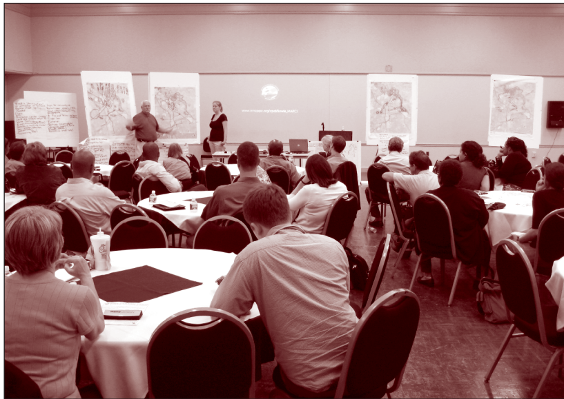
Charrette in progress.

The pre-charrette and first step of the process was held on September 18, 2008, to introduce approximately two dozen stakeholders to the sector planning process and to allow them to share their concerns and ideas about the project area and visions for the future. Participants provided valuable insights into the project area's economic, historic, transportation, and environmental issues.