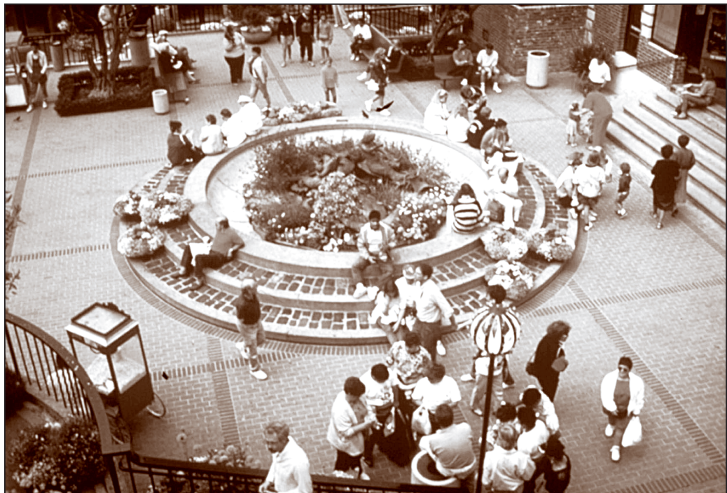
A well-designed, well-placed, and well-used public open space with pedestrian amenities creates a comfortable place to meet and relax. It also discourages criminal behavior.

Similarly, the physical and economic health of the area is tied to how safe its inhabitants feel and the image that the area presents. The image is based both on the built and natural environments. At the same time that new development is being encouraged, steps need to be taken to preserve and/or reclaim the natural areas that have been neglected and are in