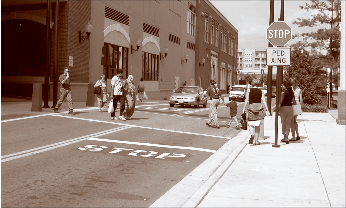
TOP: The use of contrasting paving material clearly defines pedestrian crosswalks. RIGHT: Marked and raised pedestrian crosswalks serve as traffic-calming features.