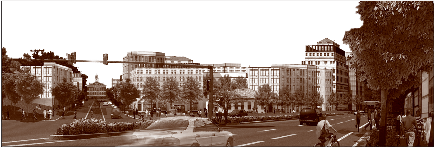
TOP: The existing Naylor Road Metro Station area. BOTTOM: Imagine the Naylor Road Metro Station area looking something like this after application of the design guidelines!

The overall appearance of the area will be significantly enhanced through the definition of streetscape design elements that transform Branch Avenue from a car-dominated thoroughfare to a tree-lined boulevard, with inviting sidewalks, landscaped medians, and linear parks. Streetscape improvements will also extend along both Silver Hill Road and St. Barnabas Road. Design guidelines are established for new development and redevelopment for features such as building setbacks, streetscape design, site design and parking, building height and massing, lighting, signage, and street furnishings. The plan establishes specific guidelines to improve the appearance and the streetscape of existing auto dealerships, strip commercial centers, and stand-alone commercial buildings.