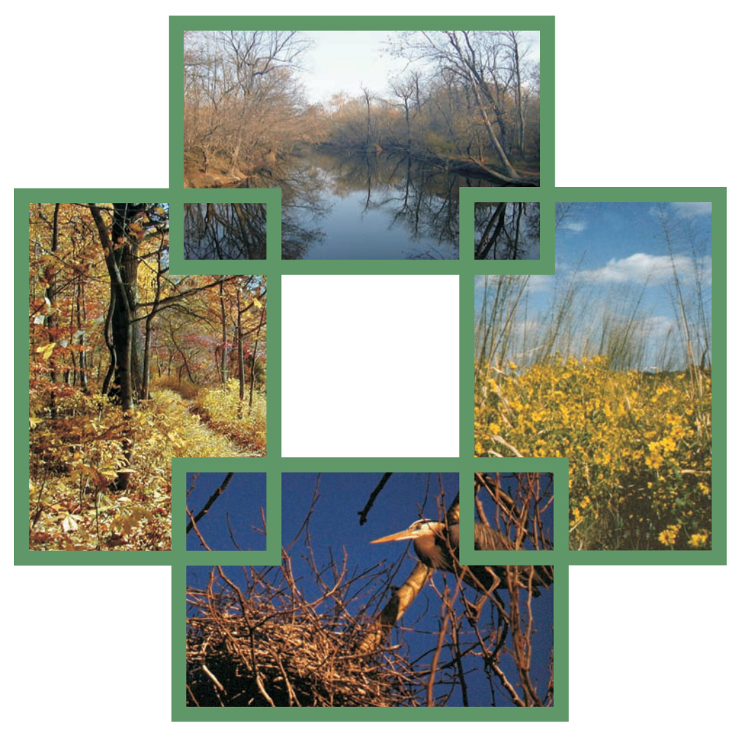
Approved June 14, 2005