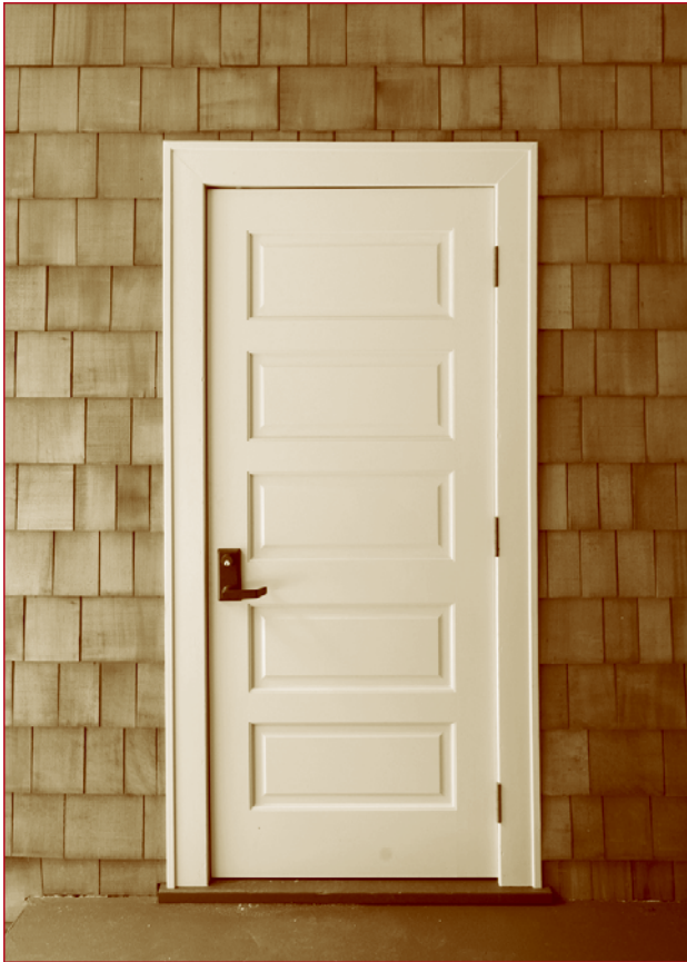
A classroom door at the newly-restored Ridgeley Rosenwald School. See page 127.

i.e., the planning area number followed by the individual property number. Cherry Hill Cemetery (69-021), for example, is property number 021 in Planning Area 69. If the historic property is located within a documented historic community, a number identifying that community is inserted as a central number. Thus, Rossville (62-023) is historic community number 023 in Planning Area 62; and Abraham Hall (62-023-07) is property number 07 within that community. (For aesthetic purposes, extra zeros are omitted within the main section of this book.)