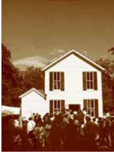
COVER: Rededication of Abraham Hall, 1991. (Historic Site 62-23-7. See page 55.)